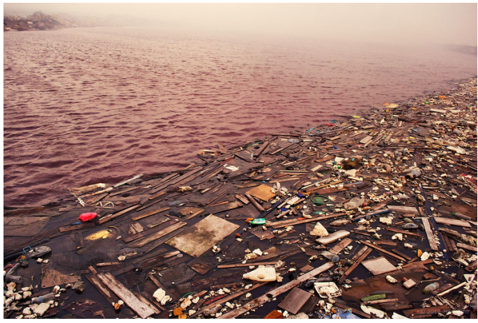
Trash in the oceans in Maldives. "Thilafushi Kuni Gondu - God's dirty little secret" by Hani Amir is licensed under CC BY-NC-ND 2.0.

The oceans and seas of the world are truly amazing and beautiful places full of life ... and our pollution! Every year, about 8 million tons of plastic waste escapes into the oceans having a huge impact on the wildlife and their habitats. Use this resource to discover the types of waste floating around the ocean and how you can help, no matter where you live!