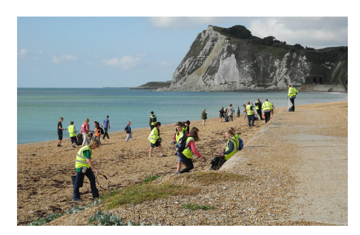
"2014 Beach Clean"

There's a lot of waste out there and as we've discovered, some people are already doing their bit to try to tackle the problem – but we all need to take part to fix it properly!