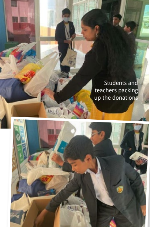
Students sorting out the donations