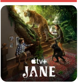
Launch of the TV Series 'Jane' – Page4