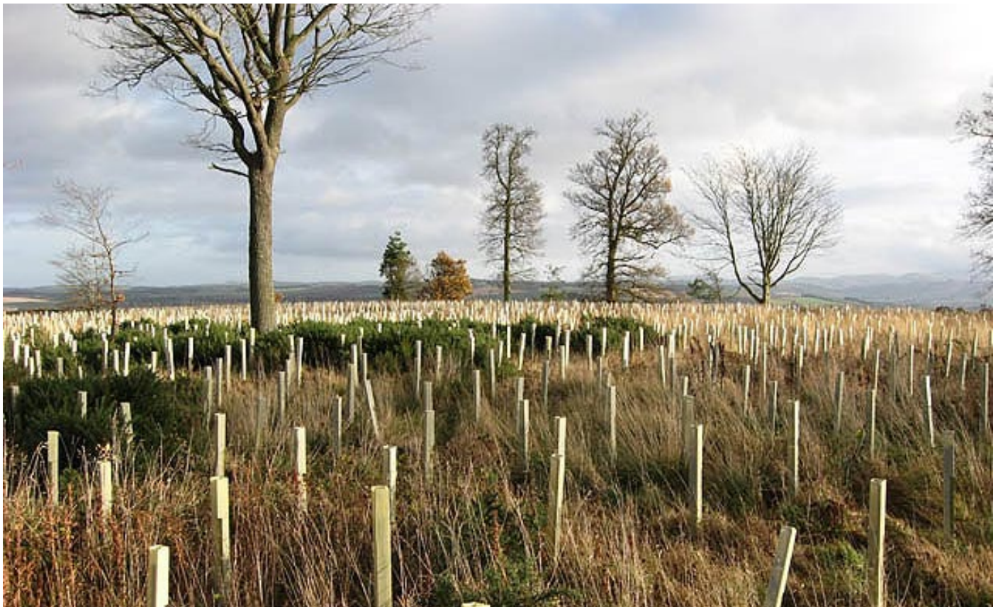
Walter Baxter / New tree planting