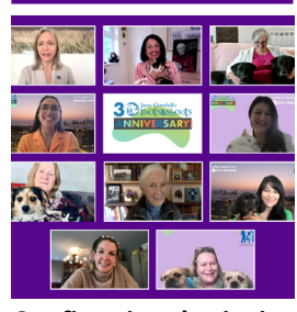
Our first virtual twinning celebration – Page 4