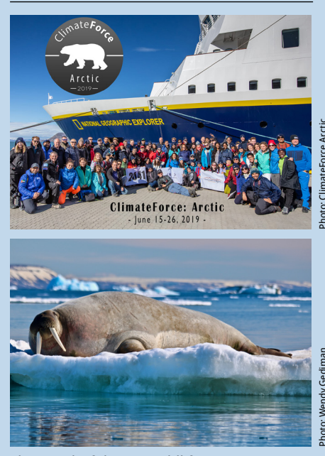
The wonderful Arctic wildlife

There is some mining going on in the Arctic, which you would not expect in such a fragile area. There is evidence of air and plastic pollution. The Arctic is in distress