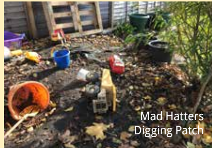
Mad Hatters Digging Patch