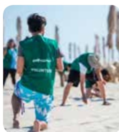
NYUAD's amazing initiatives – Page 2