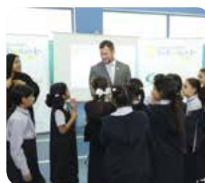
Team Zayed shares their Antarctica Journey – Page 3