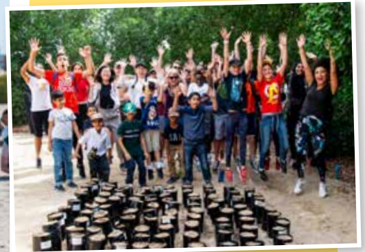
Ghaf Tree planting

Last month, the Give a Ghaf Service Kashtah brought together 60 student volunteers from around the UAE for a day of learning about sustainability in the desert environment. Through this educational day trip, students worked together to plant 250 of the UAE's national Ghaf Tree seeds at Dubai Al Barari Nursery to support the founding father's vision of transforming the desert into a green haven. The Goumbook's Give a Ghaf conservation program is important to the desert environment because Ghaf Trees serve as the basis of whole miniature ecosystems relying on their shade, seed pods, and leaves, and only require 5 litres of water per day where as palm trees guzzle up to 300.