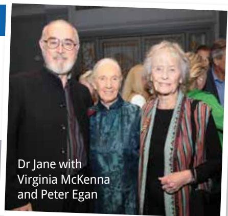
Dr Jane with Virginia McKenna and Peter Egan

She said: "I wanted to go to Africa. The