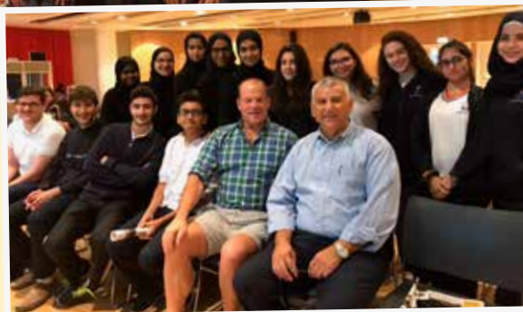
Robert Swan with students and teachers from Al Rawafed School