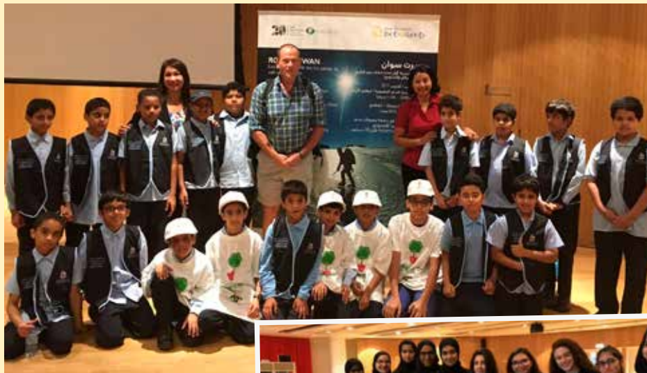
Robert Swan meeting Roots & Shoots UAE members

Roots & Shoots are calling all members to follow this journey, and to become part of the action plan. You are being asked to become Youth Climate Force Ambassadors. Simply think of at least 5 things that you can do at home, at school, or in your community, that allow you to become more sustainable in your lives. List these actions. Perhaps you will have a meatless Monday, or you will stop using plastic straws. Just remember that small actions, multiplied by many people, add up to big positive changes. You can then ask your teacher to post your activities on the Roots & Shoots website at www.rootsnshoots.ae and contribute to our climate change project.