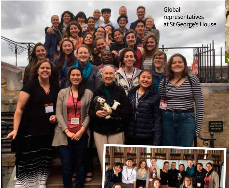
Global representatives at St George's House

I received the privilege to stay at Windsor Castle for a week, and meet with Roots & Shoots leaders from across the world.