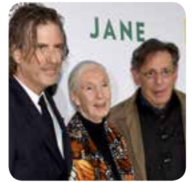
Oscar nominated "Jane" documentary – Page 6