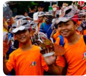
Argentina's first Animal Parade – Page 5