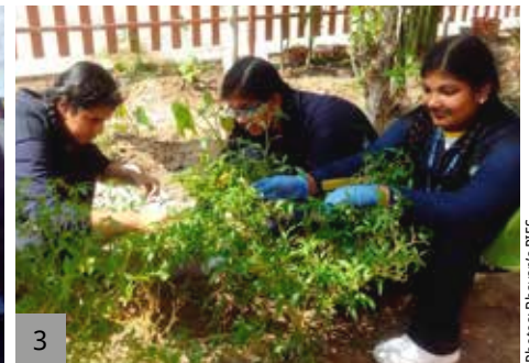
1 Ewaste collected from the public 2 Identifying seeds 3 Keeping busy in the organic vegetable garden