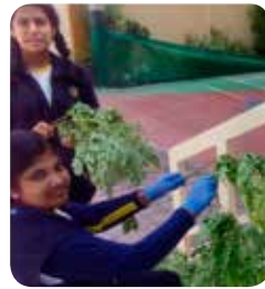
Spotlight on: Bhavan's PIES – Page 2