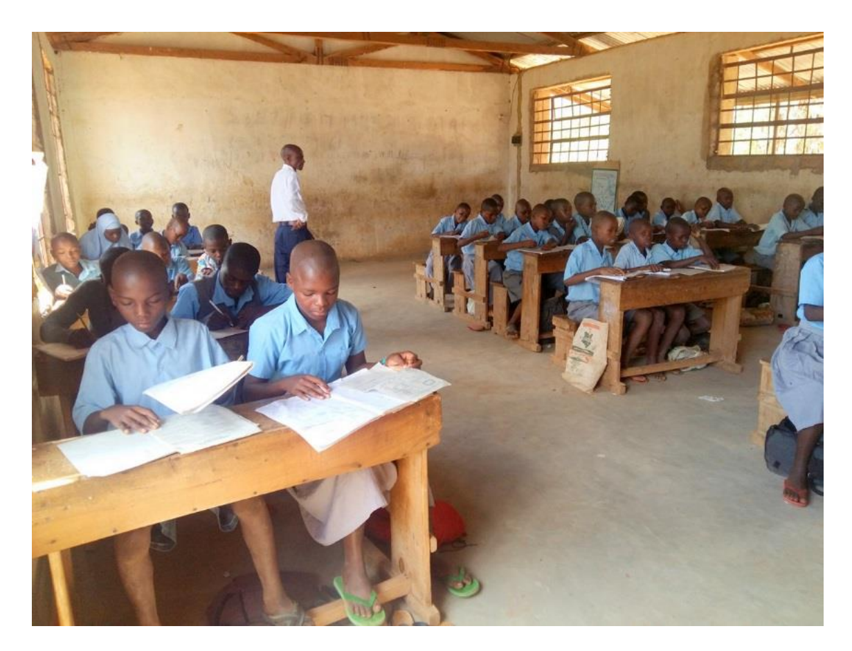
Grade 6 Pupils learning using the refurbished floor Classroom

UAS Provision of the 200 solar lights to all our upper grade pupils had a major impact to the academic's performance this term. It has made learning very efficient as children now can study and can do homework while at their homes.