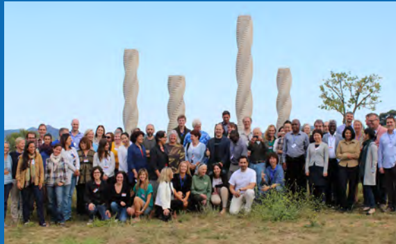
Barcelona 2015 JGI and Roots & Shoots Family

The "5 Days of Drought" involves significantly reducing the students daily water consumption in order to experience first-hand the challenges others face on a daily basis, and to learn how they could alter their behaviour on an ongoing basis in order to conserve water. By participating, they aimed to raise awareness about the plight of those