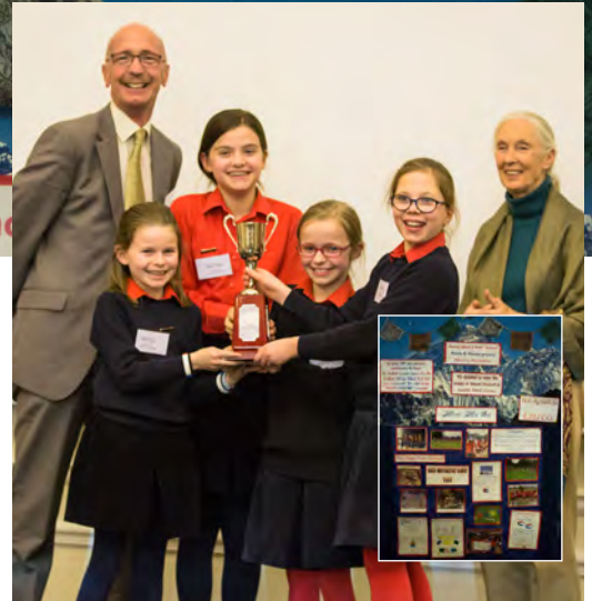
JAPS receiving their Most Outstanding Group Award, JAPS display (inset) on the Moving Mountains Project