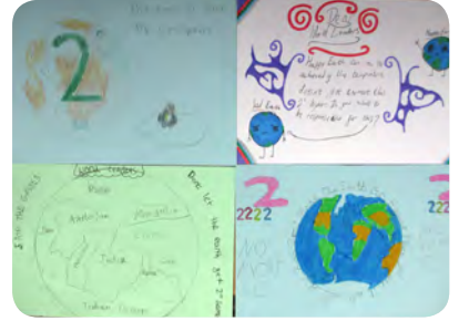
Applemore College Students have been inspired to take action – Page 5