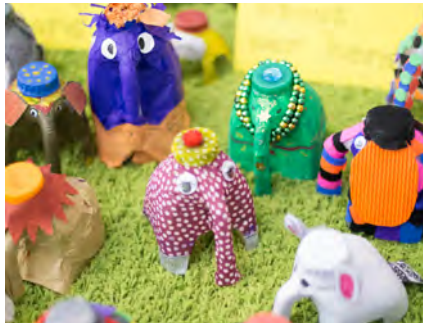
Elephant herd, Sandfield Close Primary School

The Most Outstanding Group Award was won by the James Allen's Prep School for their work raising money for people affected by the earthquake in Nepal. With some savvy and creative fundraising ideas, such as selling wristbands and making