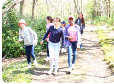
Our most Outstanding group visit Mallydams – Page 3