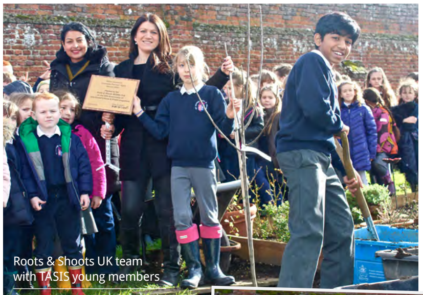
Roots & Shoots UK team with TESIS young members