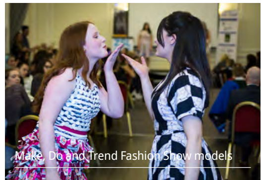
Make, Do and Trend Fashion Show models