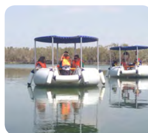
An exciting new program with Ecoventure – Page 5