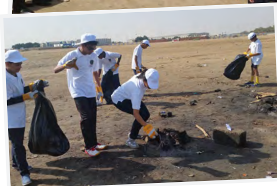
Mayoor Private School - external community outreach project at AlWathba Wetland Reserve, cleaning up as a team