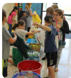
Packing treat bags for a bus raid – Page 3

Three schools were able to join the talk: Bangladesh School, ACS and Emirates National School.