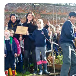
Roots & Shoots 25th Anniversary – Page 6