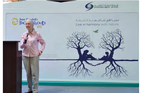
The PRC department at EAD produced a beautiful artistic back drop for the Roots & Shoots awards

The event ended with a super fun and energetic Turtle Survival Challenge Activity on the beach which highlighted the plight of the turtles in the UAE.