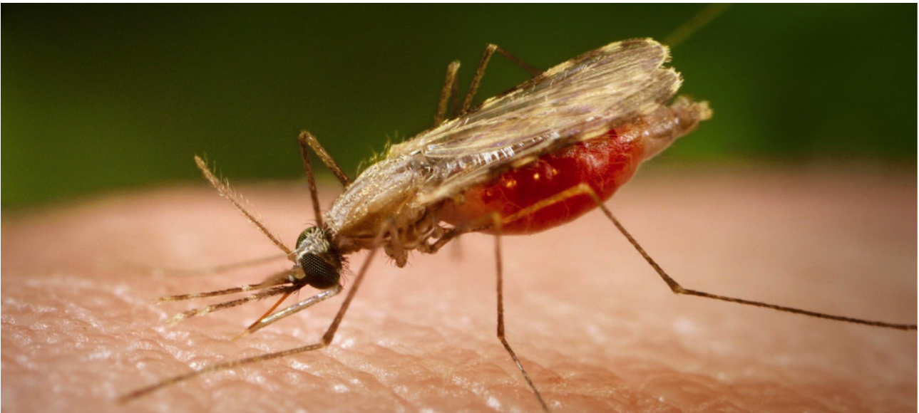
"Anopheles minimus"