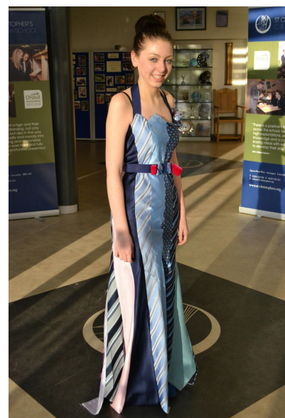
Above images taken from www.rootandshoots.org with permission

From left to right we have, a dress made from ties donated by actor Colin Firth who supports Roots and Shoots in the UK, dresses made from newspapers and magazines and a waistcoat made from bicycle inner tubes with shorts made from mail sacks.